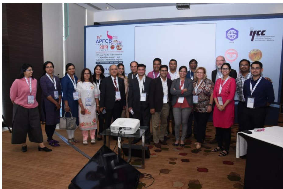
17th Nov, Workshop by IFCC–CCLM & IFCC–TFYS titled “Building Tomorrow's leaders by the young generation”