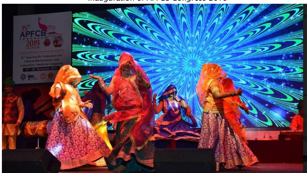
Cultural Program during Banquet Dinner