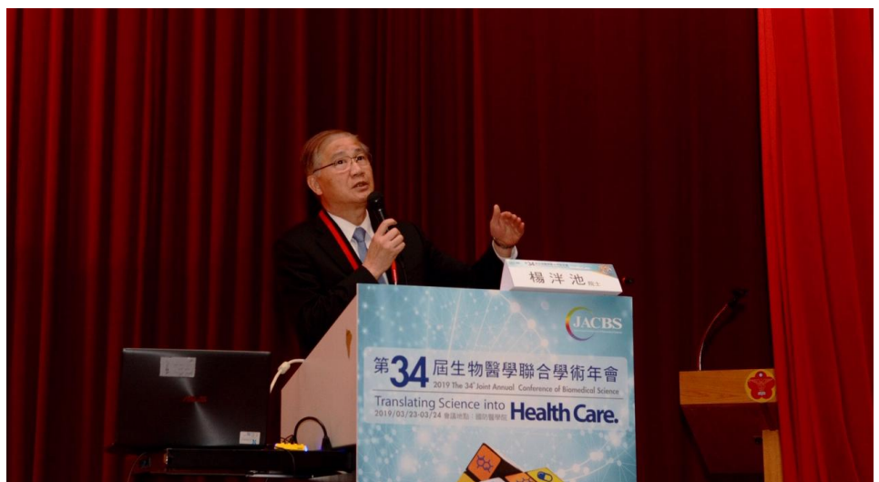
Figure 3 Plenary Lecturer of the 34 th JACBS: Prof. Pan-Chyr Yang.