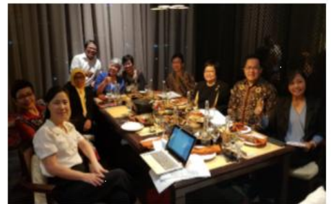
Discussion on MOU of INDRI Study of three organizations and Abbott Diagnostic