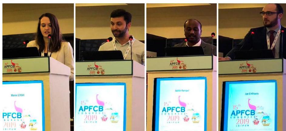
26th Nov 2019, IFCC–TFYS symposia under theme of “Clinical Chemistry to Clinical Laboratory Science – Future Challenges”

IFCC–TFYS was able to bring “IFCC TFYS Snibe Travel Awards” at APFCB 2019 with generous support of Snibe. It helped “3 Young Scientists” for travel awards and each Award consisted of a certificate & amount value of the sum SGD–1000 presented at APFCB ceremony. Though not limited, APFCB 2019 presented with tens of Awards & Bursaries supported by IFCC, APFCB, ACBI for young scientists to join congress from different countries.