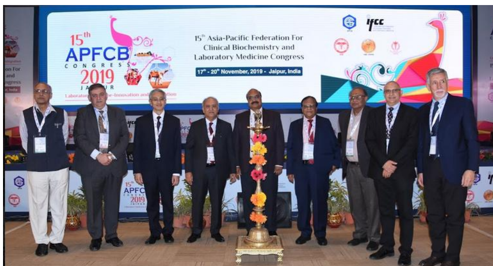
Inauguration of APFCB Congress 2019