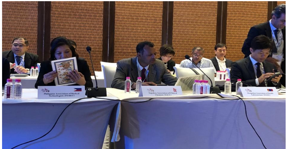
NACC General Secretary during Council meeting of APFCB