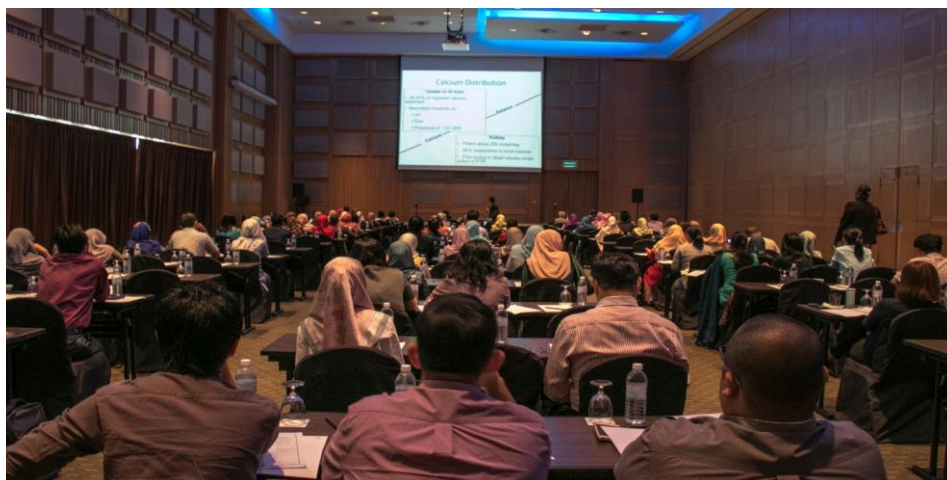
Participants at the APFCB-MACB Statistics Workshop, 2019