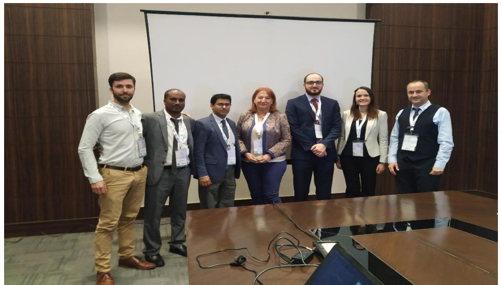
Functional meeting IFCC–TFYS 2019

IFCC–TFYS is thankful to all senior members and authorities for this unconditional support to young scientists for joining this academic feast. TFYS has also planned to organise first of its own kind “ Young Scientist Forum ” at “ IFCC WorldLab Seoul 2020 ” for participation, networking & education supported by IFCC–EB. Looking forward to meet you at WorldLab Seoul 2020.