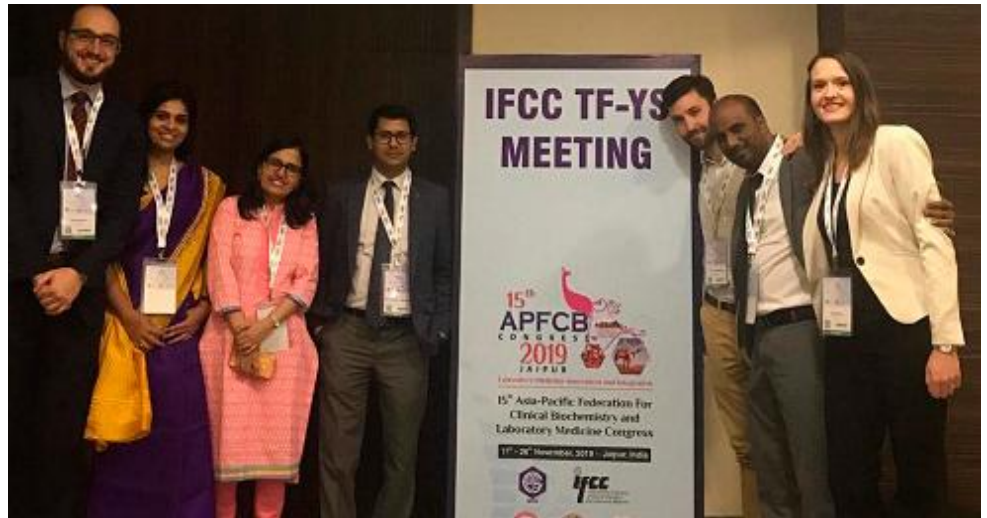
Functional meeting IFCC–TFYS 2019

IFCC–TF–YS conducted its annual functional meeting at APFCB congress discussing important projects of the Task Force, current scenario and future prospects to formalise strategy for programmes 2020. APFCB congress 2019 offered an amazing platform to young scientists for meeting colleagues and sharing experience by means of educational and social gathering. We enjoyed Indian culture with appealing traditional Indian food.