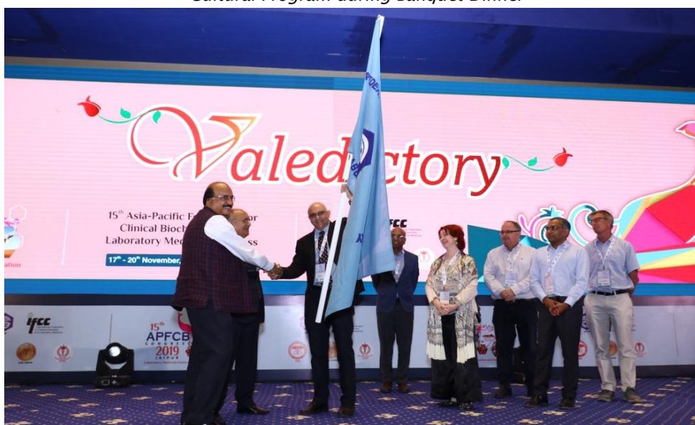
Valedictory function of APFCB 2019