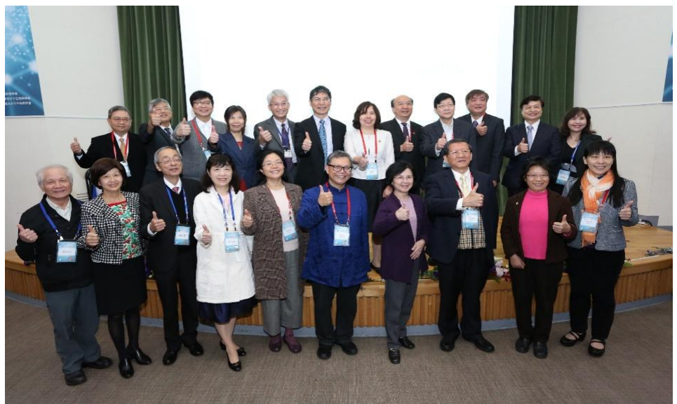
Figure 2 CACB board members, Chairs from the 9 Associations and the Minister of Ministry of Science and Technology, Prof. Liang-Gee Chen at the opening ceremony of 34 th JACBS.