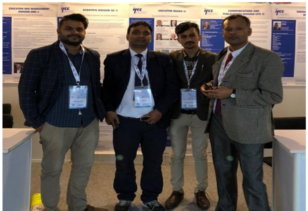
Nepalese delegates to APFCB congress