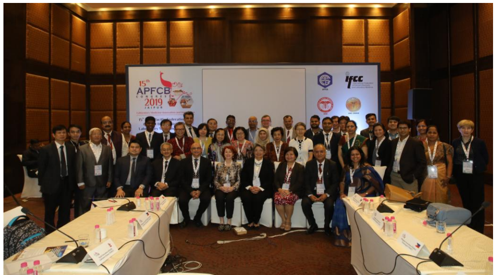
Group photo: APFCB Executive Body

There were a host of meetings during the Congress. APFCB had its council meeting on November 17, 2019. IFCC ETD and CPD also had their meeting on the same day. IFCC TFYS meeting was on November 19 and IFCC Board meeting was conducted on November 20–22, 2019.