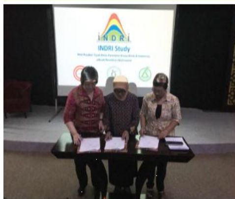
MOU signed by HKKI, PDS PatKLIn and PATELKI