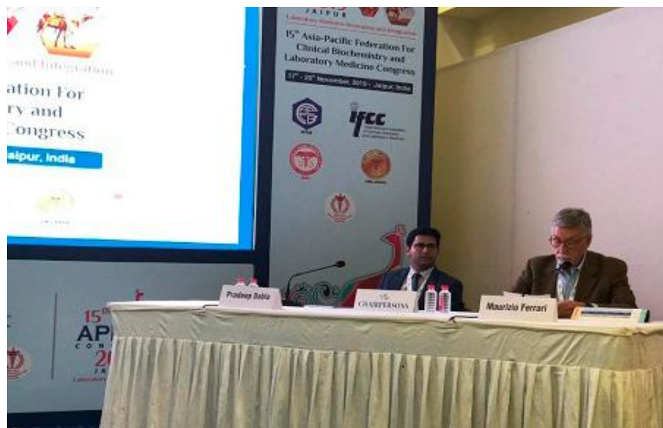
26th Nov 2019, IFCC–TFYS symposia under theme of “Clinical Chemistry to Clinical Laboratory Science – Future Challenges”