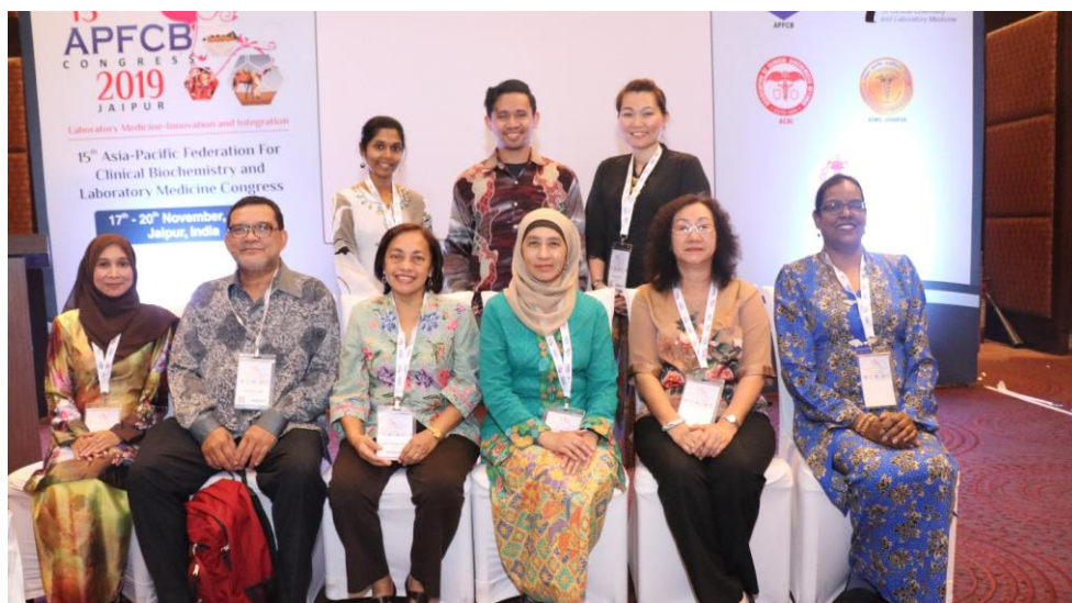
MACB Council Members and Chair of the Publicity and Communications Committee at the 15 th APFCB Congress 2019, Jaipur, India

The MACB gave strong support to the 15 th APFCB Congress. Eight MACB council members and Chairman of Publicity and Communications Committee attended the congress.